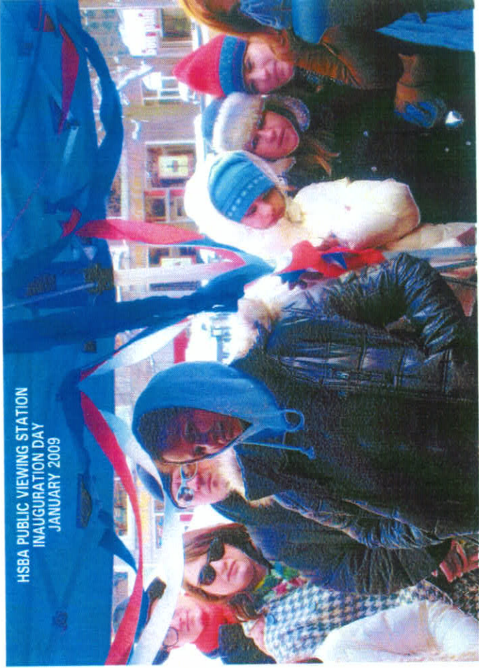
HSBA PUBLIC VIEWING STATION INAUGURATION DAY JANUARY 2009