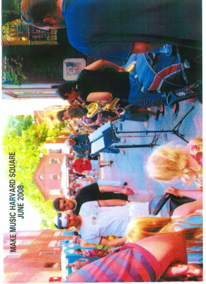
MAKE MUSIC HARVARD SQUARE JUNE 2008