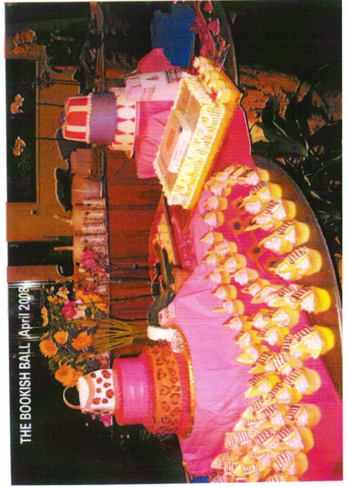
THE BOOKISH BALL April 2008