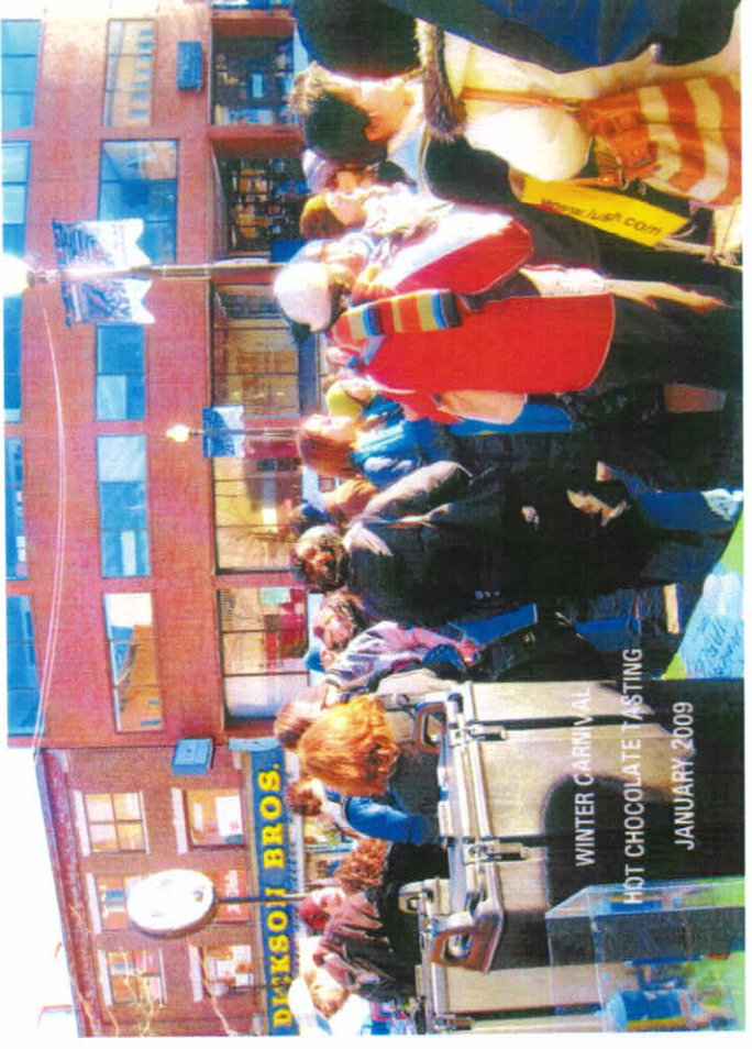
WINTER CARNIVAL HOT CHOCOLATE TASTING JANUARY 2009