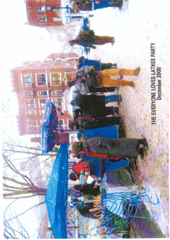
THE EVERYONE LOVES LATKES PARTY December 2008