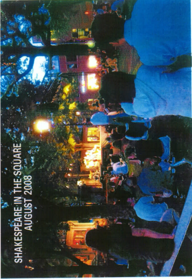
SHAKESPEARE IN THE SQUARE AUGUST 2008