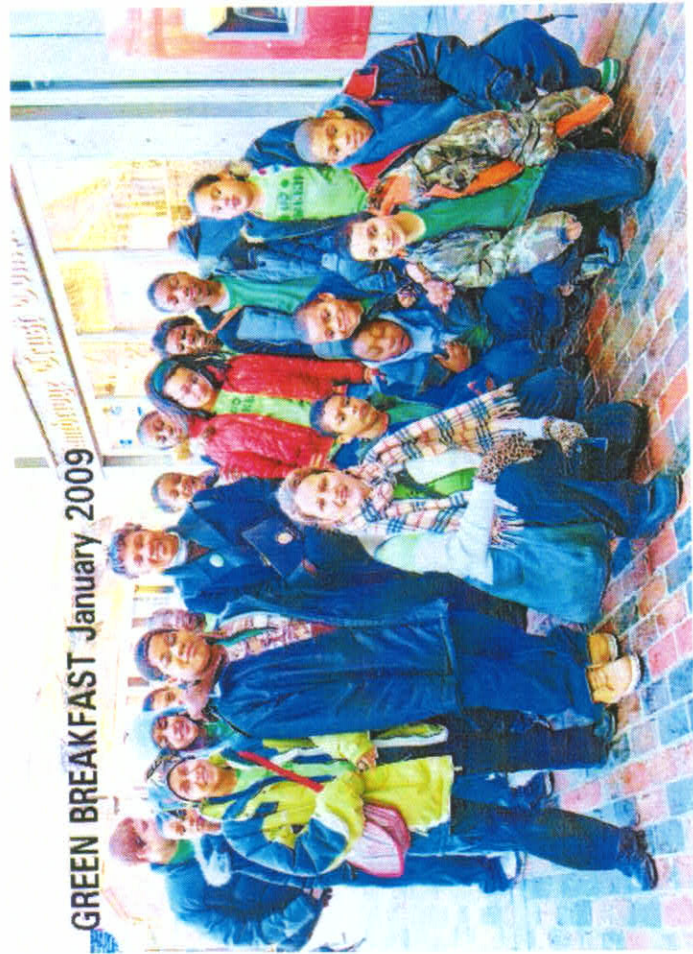
GREEN BREAKFAST January 2009